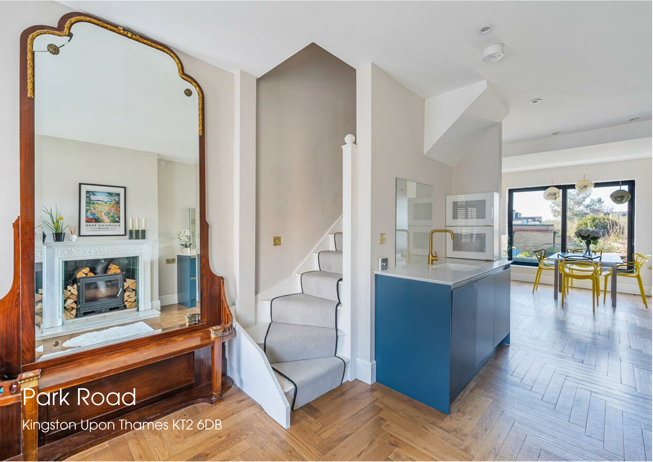
Park Road Kingston Upon Thames KT2 6DB